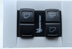
Multifunction Flush Panel